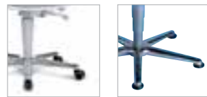
Light grey frame