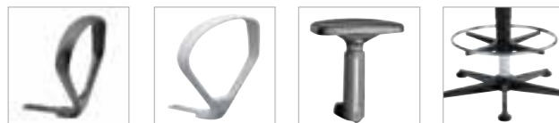
Ring-shaped armrest, black