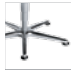
Polished aluminium 5 star base